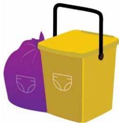
Single-use purple bags